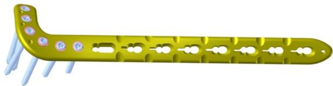
VA-LCP Anterolateral Distal Tibia Plate

Screws: 5.0mm Locking Screws / 4.5mm Cortex Screws