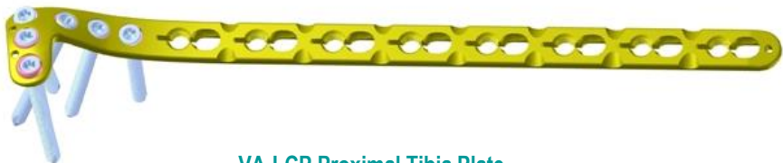
VA-LCP Proximal Tibia Plate